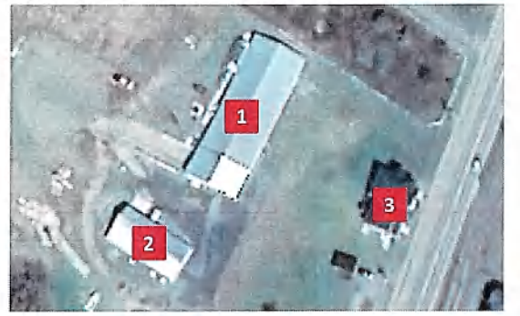
1431 Highway 1, Church Point, Nova Scotia

735-739 Highway 1, Comeauville, Nova Scotia