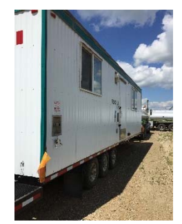
3.10.10 Water Truck Trailer