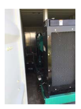
Cummins Diesel Generator QSX15 Litre