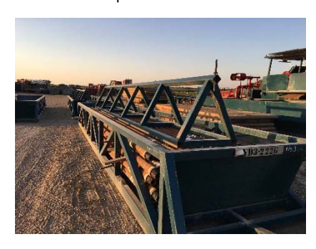
3.10.3 Pipe Tub VD3 - 222G