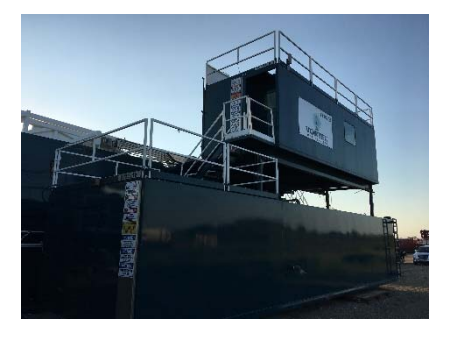
3.6 Water Tank and Doghouse