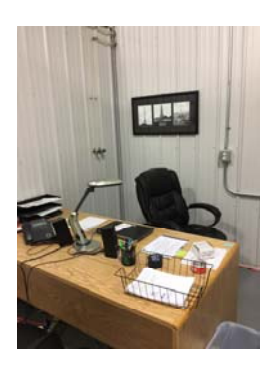
Desk and chair