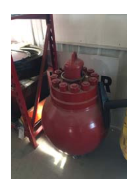
20 Gallon Dampener