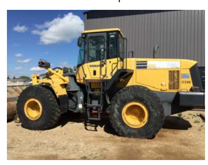
Komatsu Loader WA380