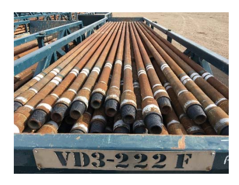
3.10.3 Pipe Tub VD3 - 222F