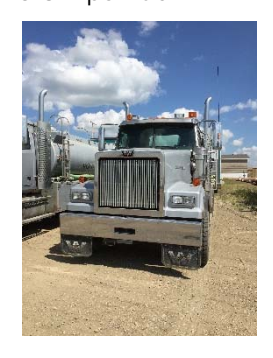
1.10.9 Water Truck