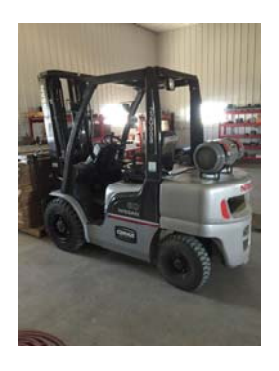
Nissan 60 Forklift