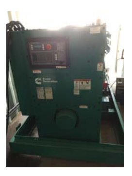
Cummins Diesel Generator QSX15 Litre