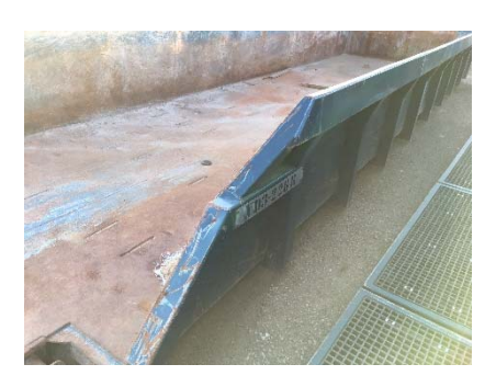
3.10.12 Shale Tank