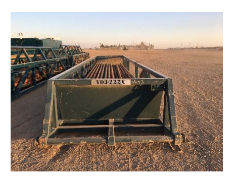
3.10.3 Pipe Tub VD3 - 222C