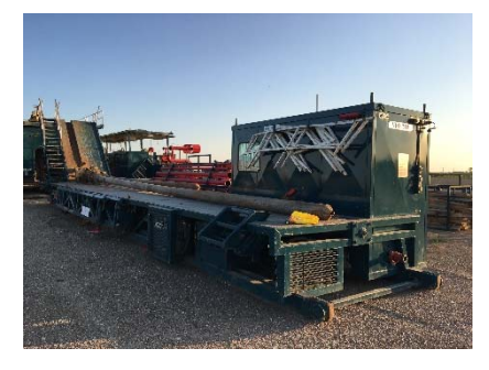
3.8 Catwalk and Manifold Shack