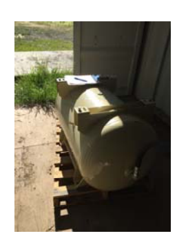
25 Gallon Air Tank