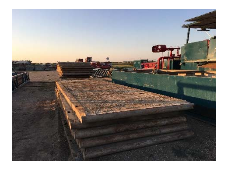
3.10.1 Rig Mats