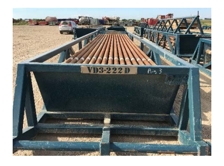
3.10.3 Pipe Tub VD3 - 222D