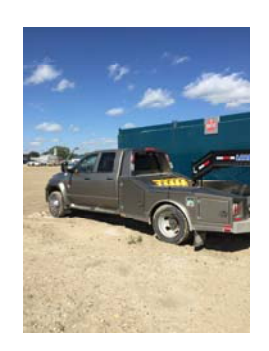
2008 Dodge Truck