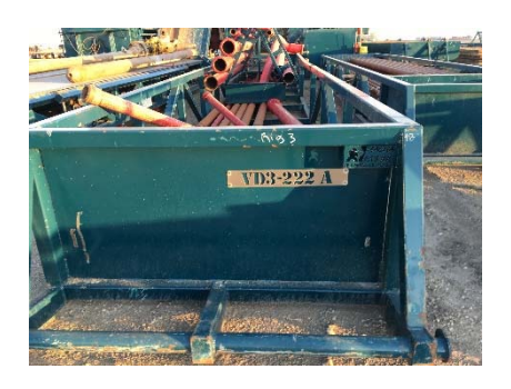
3.10.2 Pipe Rack and 3.10.3 Pipe Tub VD3 - 222A