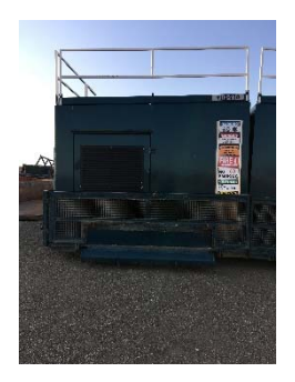
3.5A Mud Pump Building #1