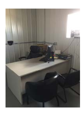
Desk and chairs