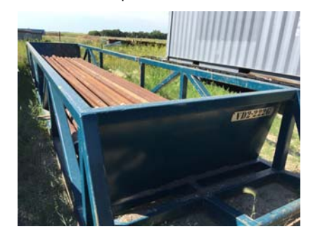
2.10.3 Pipe Tub VD2-222G