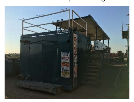
3.7 Mud Tank