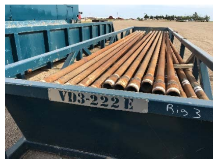
3.10.3 Pipe Tub VD3 - 222E