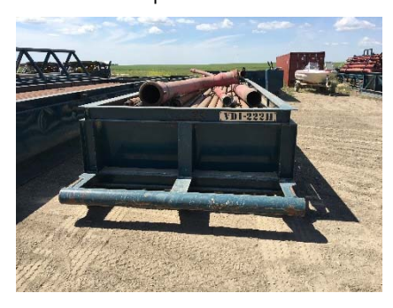
1.10.3 Pipe Tub VD1-222H