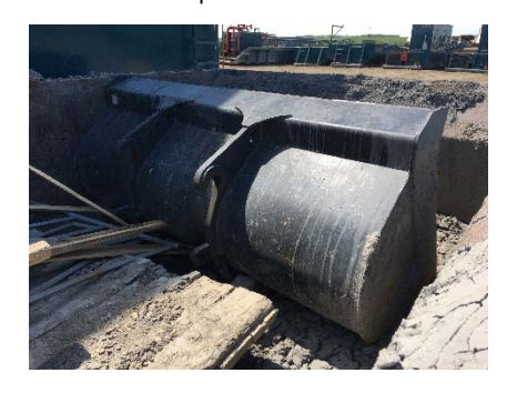
1.10.8 Loader Bucket