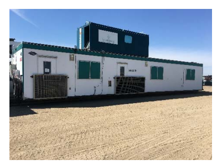
2.10.15 Rig Manager's Trailer