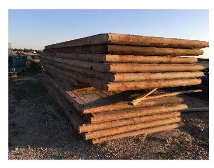
3.10.1 Rig Mats