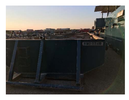
3.10.11 Flock Tank