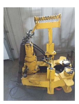
Pipe Spinner Can 700