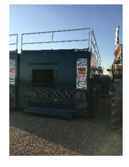
3.5B Mud Pump Building #2