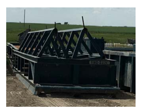
2.10.3 Pipe Tub VD2-222C