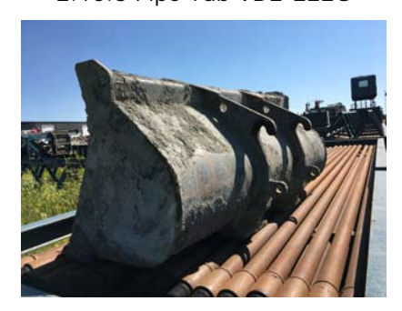
2.10.8 Loader Bucket