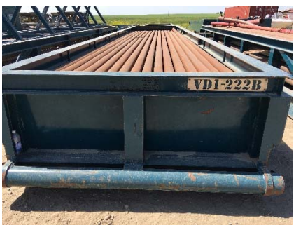
1.10.3 Pipe Tub VD1-222B