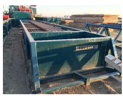
3.10.3 Pipe Tub VD3 - 222B