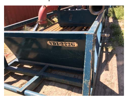
1.10.3 Pipe Tub VD1-222G