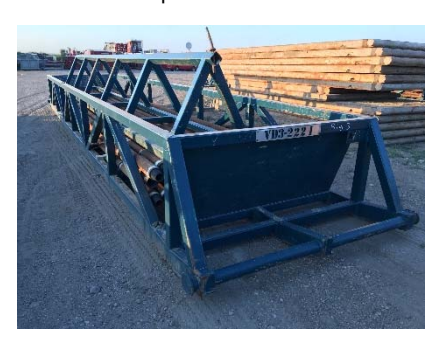
3.10.3 Pipe Tub VD3 - 222I