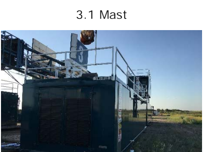
3.4 Combination Building