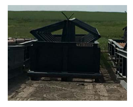
2.10.3 Pipe Tub VD2-222A