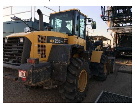
3.10.8 Front End Loader