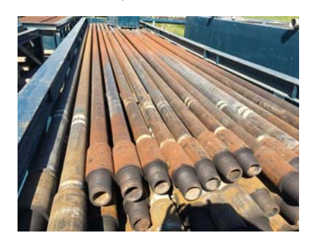
2.10.3 Pipe Tub VD2-222E