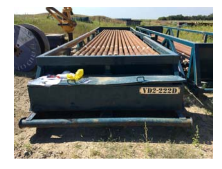
2.10.3 Pipe Tub VD2-222D