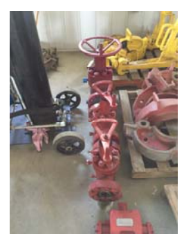
Kill Line Valves