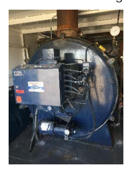
3.9 Boiler Building