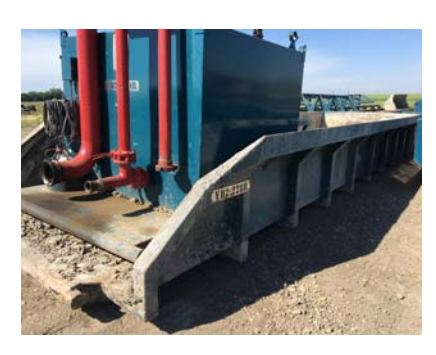
2.10.12 Shale Tank