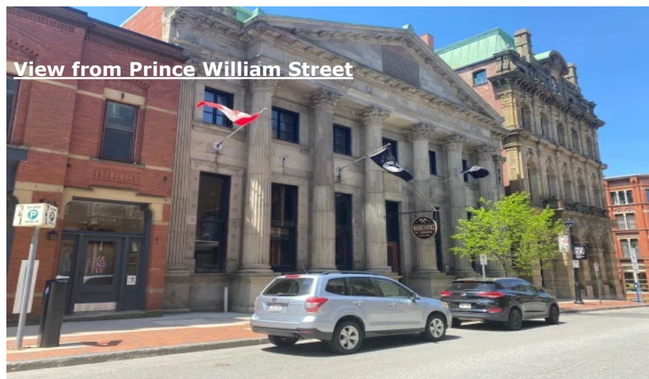
View from Prince William Street

The Property is easily accessible with entryways located at both 123-125 Prince William Street and 60 Water Street and parking is available across from 60 Water Street. Leases are in place for the majority of three commercial floors with Woodchucks Axe Throwing and Loyalist City Brewing.