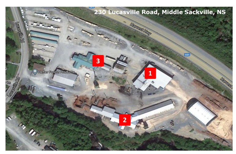
1) Power plant

In 2020, Hefler operated its sawmill assets intermittently.