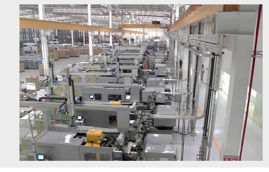
6 of the industry's largest 2-shot rotating platens & injection molding machines

An inside-the-walls look at this impressive facility