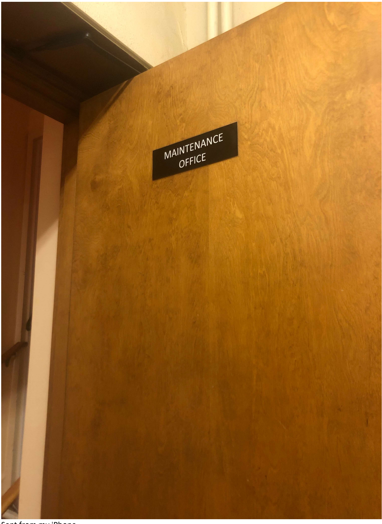
Sent from my iPhone